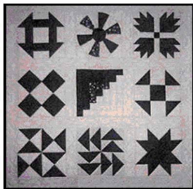
Figure 2. Ozella's Underground Railroad Symmetrical Freedom Quilt

In so doing, quilts were hung with other items to be aired out so most people believed that quilts were just a kind of bed-covering that needed to be aired. However, to those people who knew how to identify the secret codes in the quilt pattern, this meant the difference between slavery and freedom. Since slaves were not taught to read or write in English, they developed an intricate system of secret codes, signs, and signals to communicate with one another along the routes of the Underground Railroad. In order to memorize the whole code, a sampler quilt was used. The sampler quilt included all necessary patterns that were arranged in the order of the code. Freed slaves traveled from one plantation to another to teach to other slaves the translation of the codes of the sampler quilt patterns (Wilson, 2002).