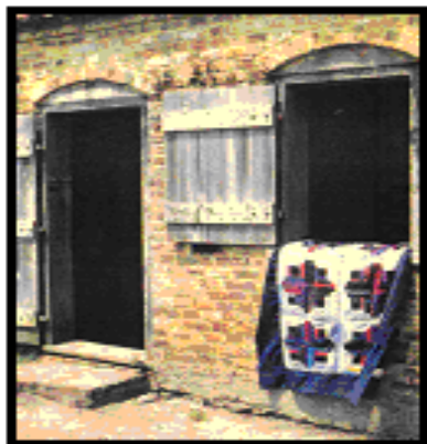
Figure 1. Freedom Quilt displayed on window-sill

The quilts were sewn to serve as a coded map for runaway slaves to memorize. Slaves followed symbols on Freedom Quilts that were hung out during the day to give guidance, directions or dangers that lay ahead. This method of communication was very effective, because bounty hunters apparently never caught onto the quilts and their messages (Rosa & Orey, 2009).